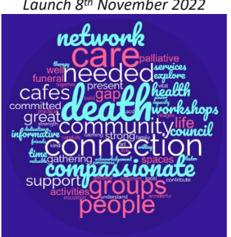
Word cloud from the evaluation of the Community Forum and Launch 8<sup>th</sup> November 2022